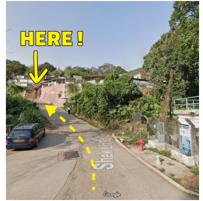
Entrance at the slope 入口在斜坡