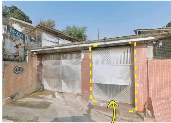
Main Entrance 正門

Opening Hour 開放時間 EVERY DAY 每天 10 AM - 1 PM 3 PM - 5 PM